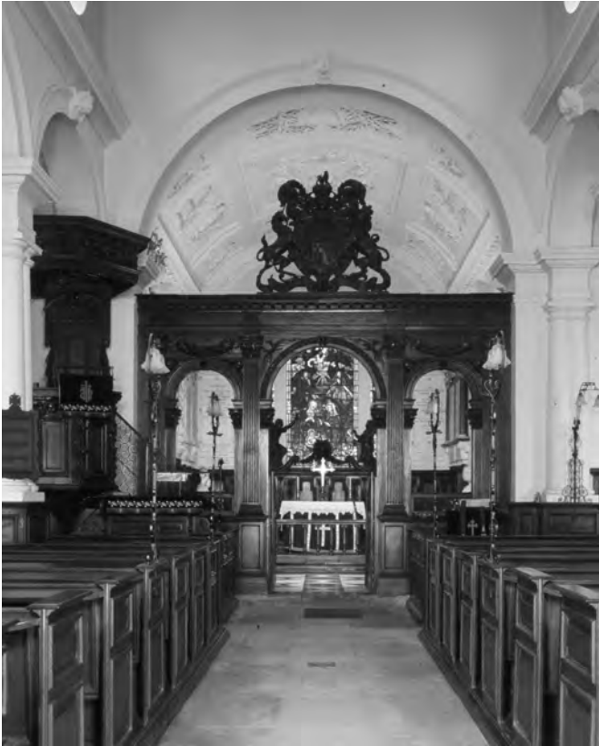
Competing visions for the Church of England

raised questions about the role of the King as Supreme Governor of the Church of England. Cranmer's dilemma returned: so much energy had been invested in the Stuart family and in their divine right to rule, that when it was fatally compromised there was little choice but to support the coup d'état of 1688 which brought William and Mary to the throne.