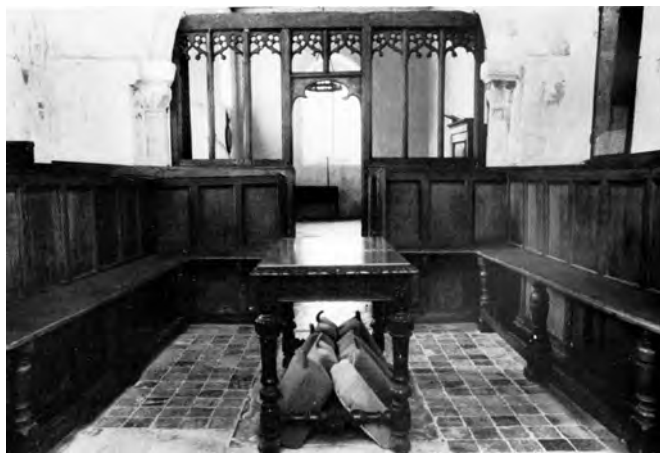
7. Chancel of Hailes Church, Gloucestershire. The communion table is set 'tablewise' in the chancel, as suggested in the second Book of Common Prayer.