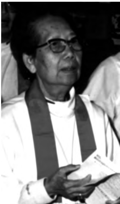
14. Florence Lei Tim-Oi, first woman priest of the Anglican Communion at a 1987 service on her 80th birthday

The following January he ordained her priest, writing to Temple: ‘I have had an amazing feeling of quiet conviction about this – as if it was how God wanted it to happen rather than a formal regularisation first.’ Although Temple did not have any theoretical objection to the ordination of women, he condemned the action as ‘contrary to the laws and precedents of the church’. Despite being given unanimous approval by her diocesan synod, Tim-Oi surrendered her licence after the war without resigning her orders. Lambeth 1948 declined to allow other deaconesses to be ordained priest. Nevertheless, the precedent had been set: it was possible for provinces to ordain women unilaterally.