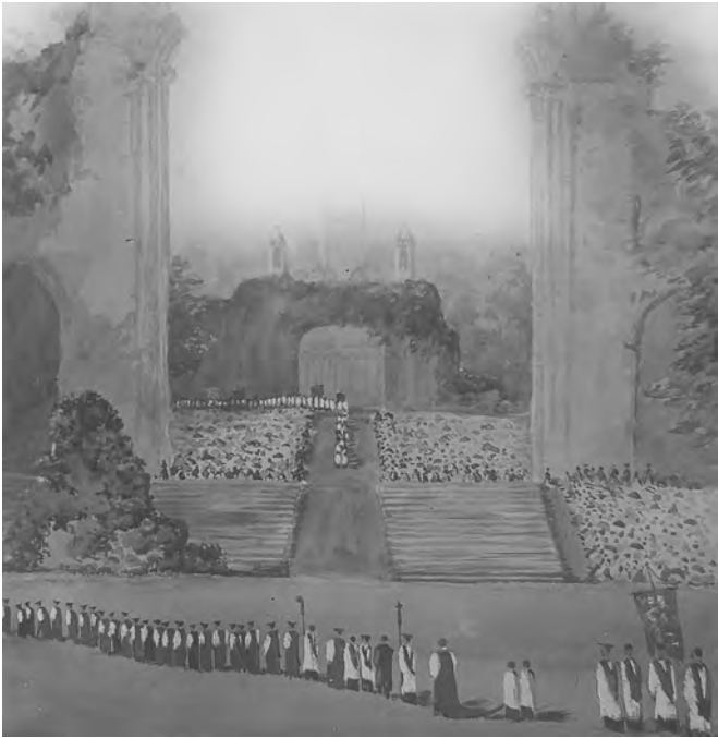
1. Procession of Anglican bishops at Glastonbury, 1897