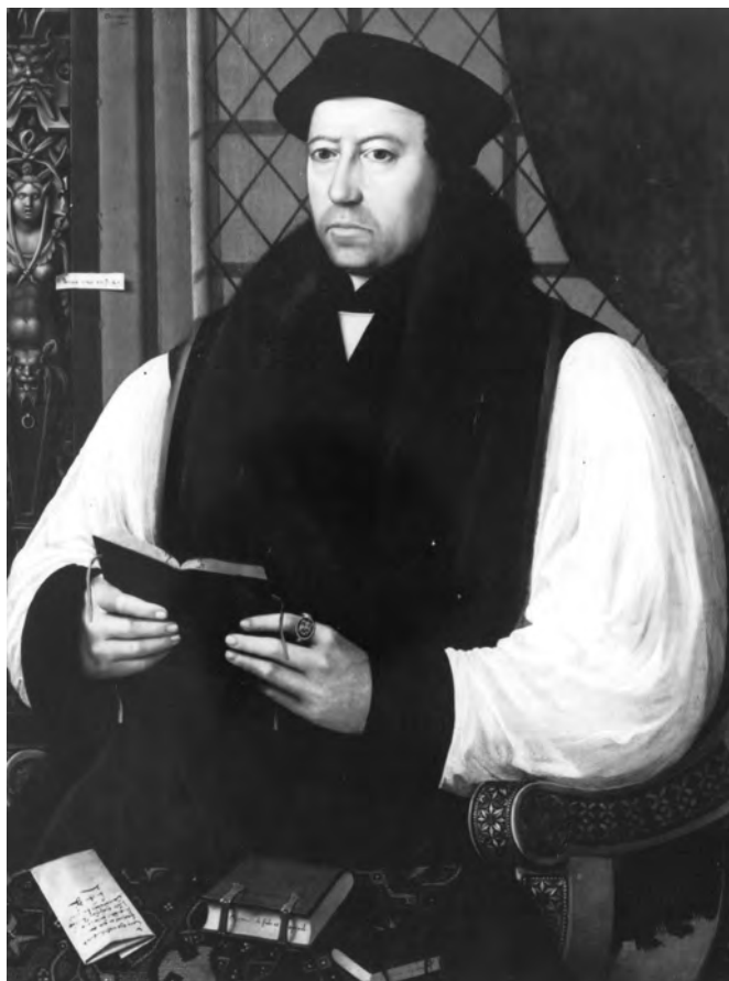
4. Thomas Cranmer, Archbishop of Canterbury under Henry VIII and Edward VI, was the chief compiler of the Book of Common Prayer

Cranmer failed to initiate doctrinal reform in Henry's time after the King's change of opinion in the late 1530s. Not surprisingly, there are many pictures of Cranmer as the man who drifted with the tide, the 'teflon prelate', as the historian Patrick Collinson put it. In Edward's reign, his reformed credentials were clear. His homilies