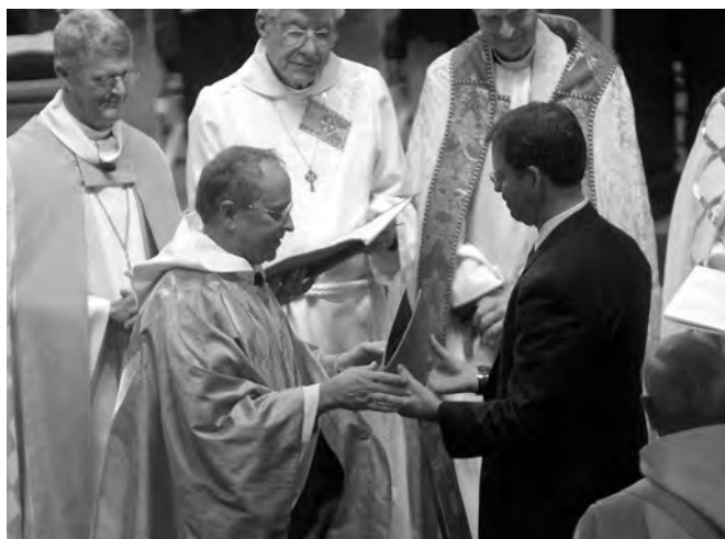
16. Bishop Gene Robinson, the first openly homosexual bishop in the Anglican Communion, receiving his Mitre from his partner

rather than a provincial or international matter: the impact on the global communion was not considered crucial compared with the right of the diocese to act alone. The old political doctrine of ‘states’ rights’ had won against ‘federal’ Anglicanism.