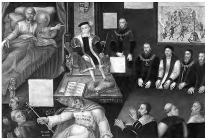
3. The infant King Edward VI is shown with his counsel, ensuring the Pope has no jurisdiction in England