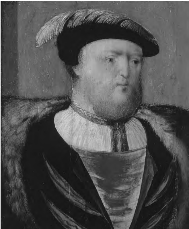
2. Henry VIII, creator of the independent English Church, in the late 1530s